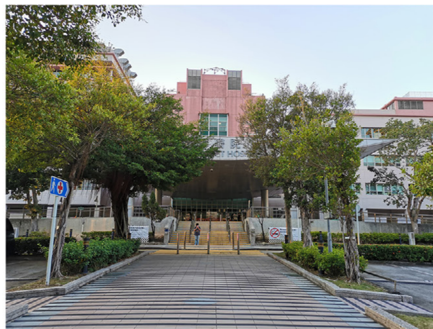
LR6.1 NORTH DISTRICT HOSPITAL