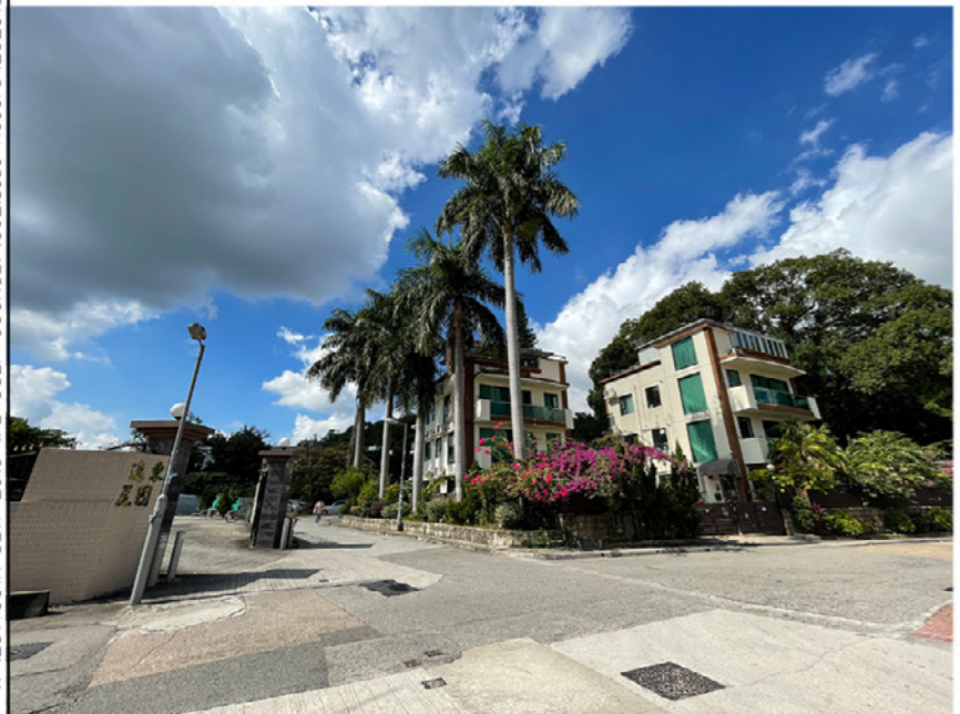
LR5.3 VILLAGE ENVIRONS