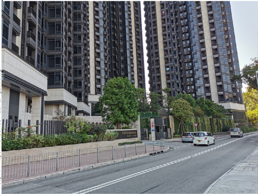
LR5.2 BUILT UP AREA