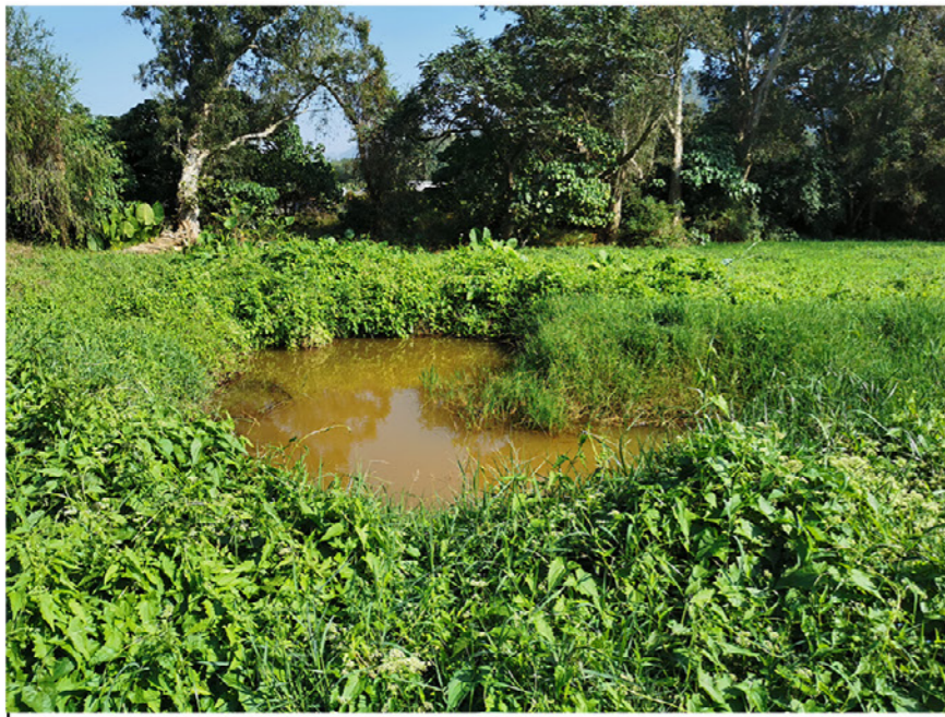
LR4.3 WETLAND IN GOLF COURSE