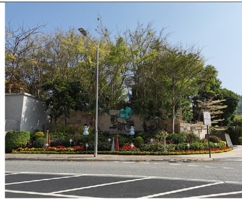
LR5.1 LOW DENSITY RESIDENTIAL AREA