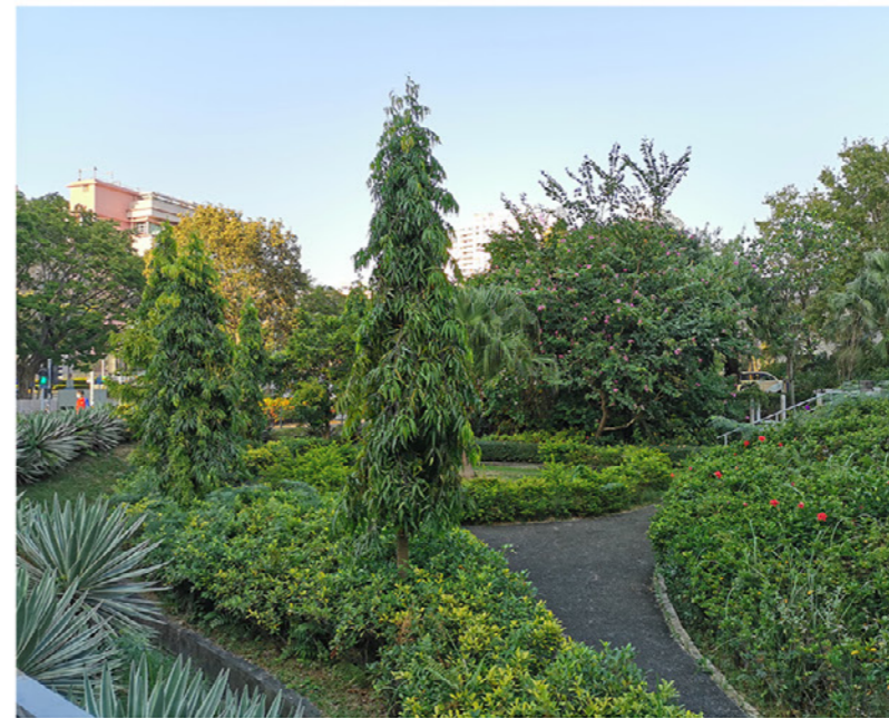
LR6.2 LITTLE SISTERS OF THE POOR ST. JOSEPH'S HOME FOR THE AGED